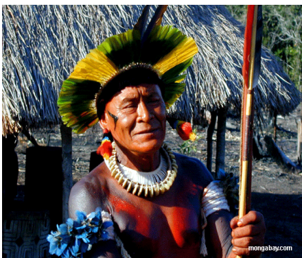
Learn about who lives in the rainforest