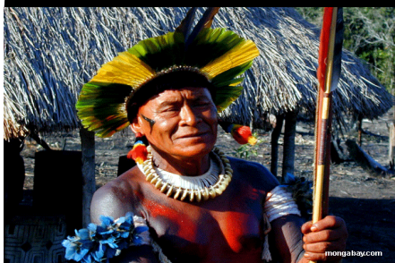
Learn about who lives in the rainforest